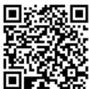
New Titles QR Code